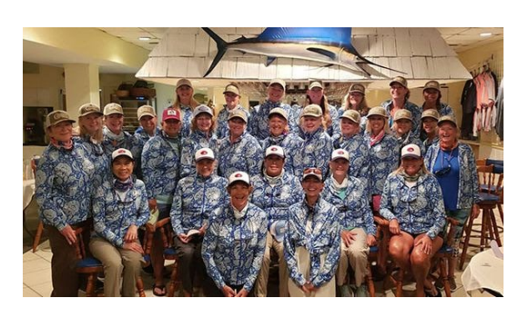
IWFA Ladies Tournament