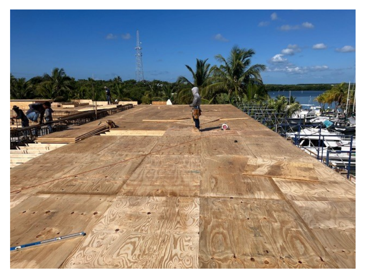
Bay View Makes For An Awesome Sunset