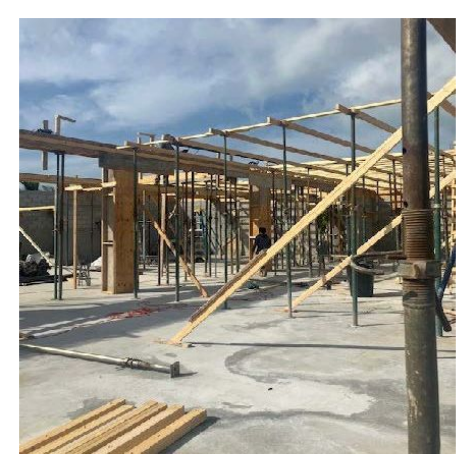
3rd Floor Beams Being Tied into Columns